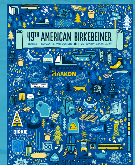
Slumberland American Birkebeiner & Birkie Week Events